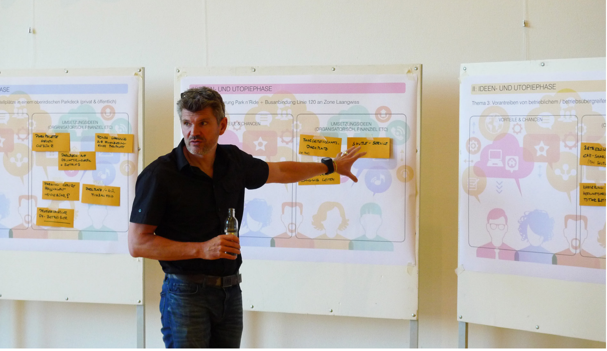
Working session with the project management group