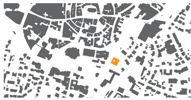
Figure ground plan

The three-storey new construction is designed in line with considerations of the urban development concept of the city of Lüdenscheid and deliberately positioned on the northwest site boundary. Due to its spatial positioning, the structure forms the heart of the quarter, the starting and focal point between educational institutions, residential area and old town. As a result of its location within the exterior space, it is a key feature of the start of the quarter.