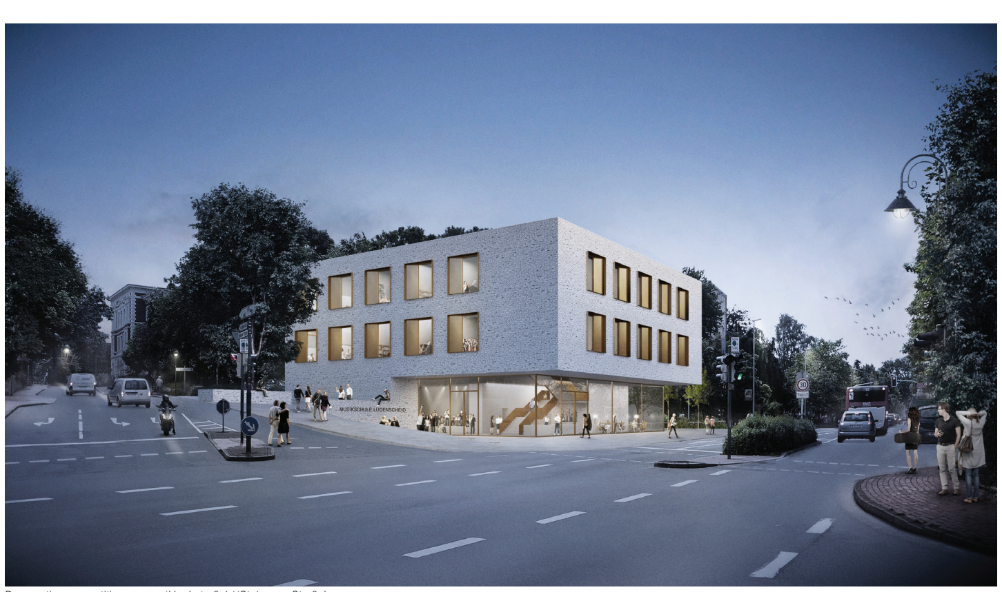
Perspective competition, corner 'Hochstraße' / 'Staberger Straße

The height and location of the three-story structure is a perfect fit for its urban environment, making a positive impact on the surroundings. Skillful integration of the architecture into the topography has created a clear entrance and site configuration, as well as extensive landscaping and functional terraces. The entrance of the building with a spacious lobby overlooking the old town and correctly positioned entrance is the right solution for this project. It functions simultaneously as the main entrance and reception area of the new music school. The building's clear façade, with its simple, geometric lines, could form a harmonious connection to Lüdenscheid's Old Town. Brick as a visually pleasing and haptic substance, but also durable and timeless material for buildings and open space use, is best for this project. One critic is that rather than invoking symmetry, the façade could inspire a bit more tension.