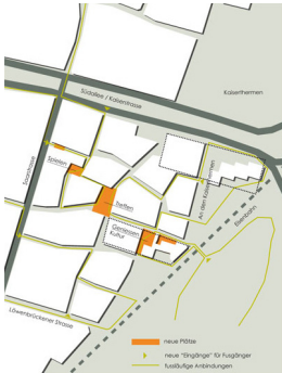
places and lanes