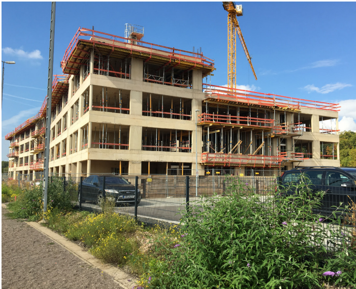
construction site 09/2017

The land intended for the IKK administrative building is located in the Eurobahnhof quarter, a development area on the north side of the main station, within walking distance of the Saarbrücken city centre. The construction project occupies the most prominent position at the end of the Europaallee, which opens on to the area as a central axis. The construction project is divided into two buildings: the main building and the annex. A former water tower building listed as an historical site is located on the smaller of the two plots.