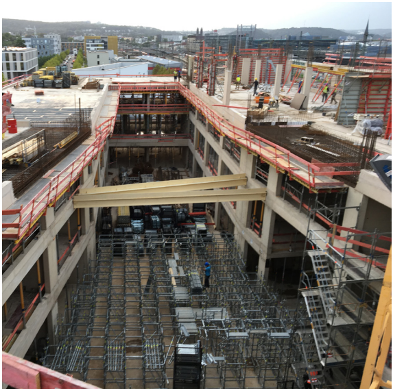
construction site 09/2017