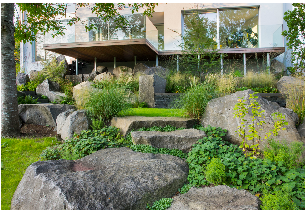
open space planned by Garten Landschaft Berg