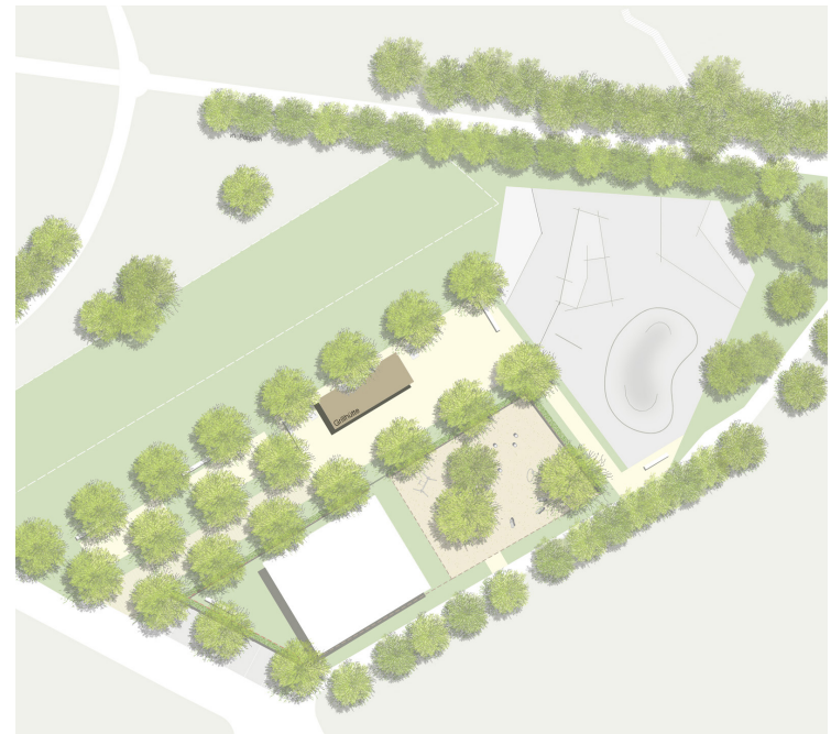
site plan - ernst+partner landschaftsarchitekten