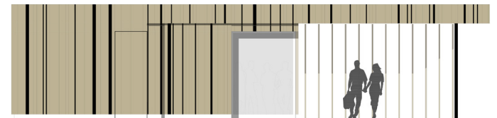
elevation - open