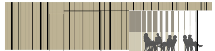
elevation - closed